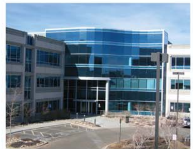
12303 Airport Way Broomfield, CO 80021