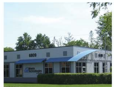
6809 Corporate Drive Indianapolis, IN 46278